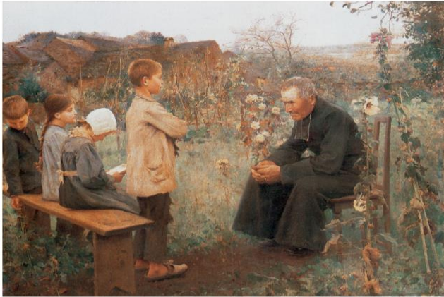
Jules-Alexis Meunier's The Catechism Lesson

Catechism is the preeminent form used to learn or teach the essentials of the Christian faith in a condensed manner. While catechism is the content of the book, the person being taught is known as the catechumen, and catechist is the person doing the teaching. The instruction itself is called catechesis and the process of imparting the teaching is known as catechizing. Every catechumen is a potential catechist. Apostle Paul declares in Galatians 6:6, “Nevertheless, the one who receives instruction