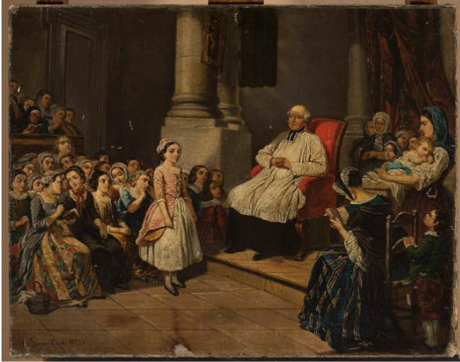
Catechism Lesson. 1859 Painting by Józef Szermentowski. National Museum in Warsaw Public Domain

The purpose of this catechism is to impart the vital beliefs and practices of the Christian faith. It is expected that this catechism will become a point of reference for the composition or revision of future catechisms that are contextualized for each context. This catechism is also a point of reference for church leaders, both clergy and laity, who are involved in the teaching and training of new believers; it is also a point of reference for all Christians