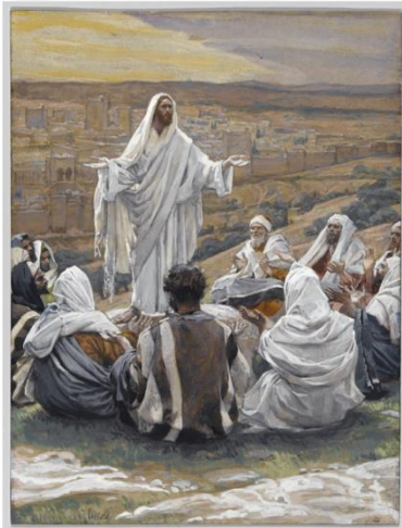
James Tissot's The Lord's Prayer (Le Pater Noster) Brooklyn Museum.

The Lord's Prayer, sometimes called Our Father (Latin: Pater Noster), is a cherished Christian prayer taught by the Lord Jesus Christ. This prayer unites all Christians around the world. The Lord's Prayer is a moral compass for believers seeking the Lord's guidance. It is noteworthy that Jesus' disciples requested from him to teach them how to pray. This is the prayer he gave